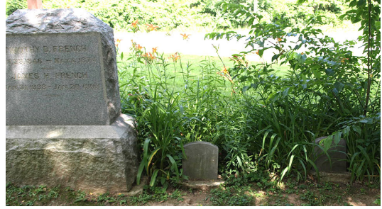
Before (July 2009)