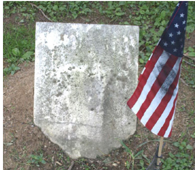
Before (July 2009)