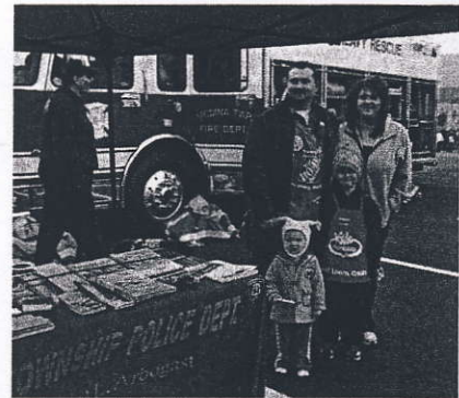
Home Depot Safety Days