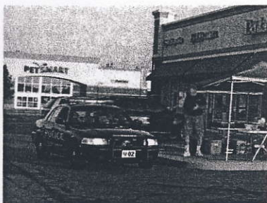
Sgt. Zieja traffic control for Road Runners Race