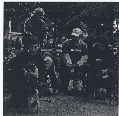
"Walk with your best friend" Against Abuse