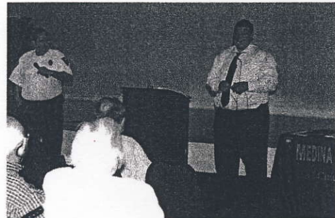
Presentation at Masonic Temple on Elderly Abuse